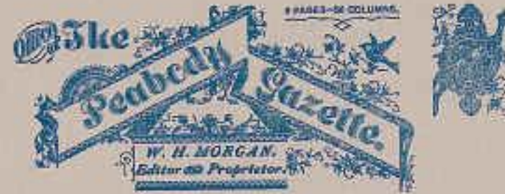
Peabody, Kansas 1888