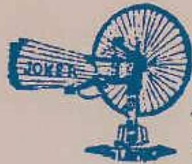
The all wood Joker windmill, 1/3 Scale working model.